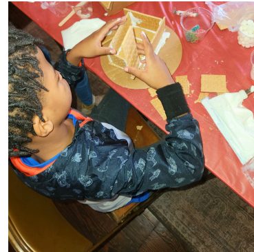
A few pictures from the 2025 Gingerbread House event.